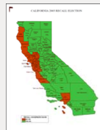
2003 Special Election Statewide Database