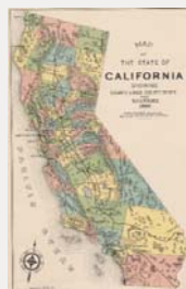
County Seats & Railroads